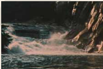
This could have been the Wa River in Thailand instead of the Chattooga River, in Georgia, USA used in "Deliverance".

The other day on cable TV here in Bangkok, Deliverance was on. It made us think of white water rafting.