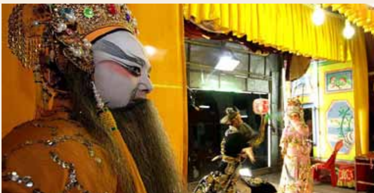
Chinese Opera plays in Thailand's countryside

China has always played a leading role in the culture and heritage of Thailand and there are many architectural, cultural and lifestyle markers throughout Thailand. From food to temples, sports and daily activity to signs of Chinese deities and in Chinese characters, you will find them all here.