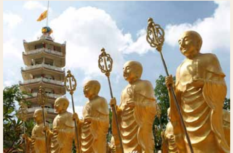
A Chinese temple in Songhla