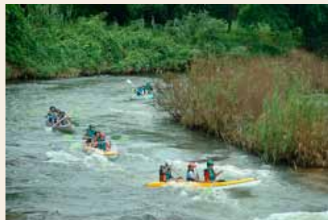
Prachin Buri information courtesy Tourism Authority of Thailand Region 8 Office

At Kaeng Wang Bon, a minor rapid, powerful V-shaped waves frequently steer rubber rafts right into a mesh of bushes and protruding branches that line the banks of the river. While at Kaeng Wang Sai, rocky mounds of various sizes scattered throughout this 80-metre section of the river generate undulating waves. It takes sheer dexterity to steer the craft whilst dodging the obstacle course.