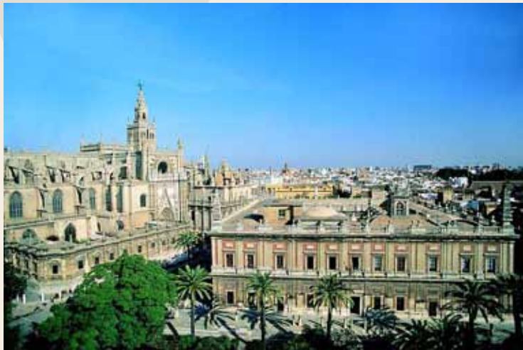
La Giralda famous landmark in Seville, Spain

The Thailand Film Office, seeking to capitalize on European interest in the merits of using Thailand locations for their feature films, commercials, TV programs, music videos, etc. will be represented at the first Seville International Locations Expo (SILE), which will run November 5- 8th, 2009 in Seville, Spain .