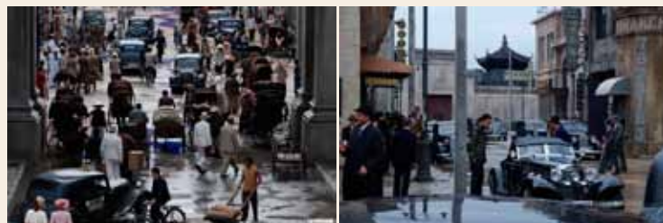
Shanghai set photos