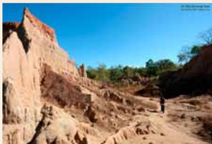
Sri Nan National Park

Nan province is very mountainous and sparsely populated by Yao, Htin, Hmong, Thai-Lue and the primitive nomadic Mabri or Phi Tong Luang tribe who still migrate around in remote forest areas.