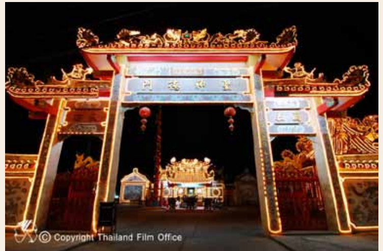
A Chinese temple in Khon Kaen