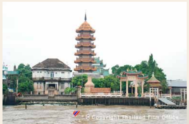
Along the banks of the Chao Praya River in Bangkok