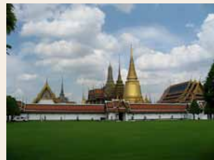
The Grand Palace, Bangkok