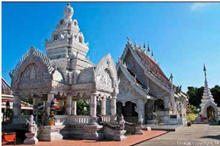
photo of Wat-Ming-Muang mythical temple courtesy of Tourism Authority of Thailand

In 1558, the town was conquered and depopulated by the Burmese. By the late 18th century Nan forged an alliance with the new Bangkok centered Rattakosin Kingdom and existed as a semi-autonomous kingdom with a line of monarchs that ruled from 1786 until 1931. Today, Nan is still the home of numerous Thai Lue and other hill tribes who retain many of their fascinating customs and traditions.