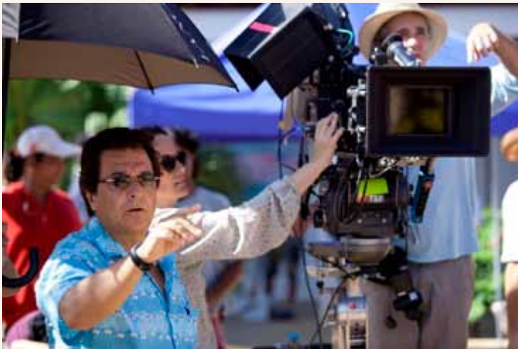
photo of director Clavier

Presently the company is producing a feature film You Don't Choose Your Family (On ne choisit pas sa famille) directed by well-known French actor and first time director, Christian Clavier.