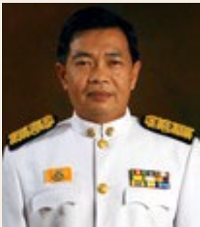
Mr. Alongkorn Ponlaboot Deputy Minister of Commerce

The following information is abstracted from the Bangkok Post, August 14, 2010: